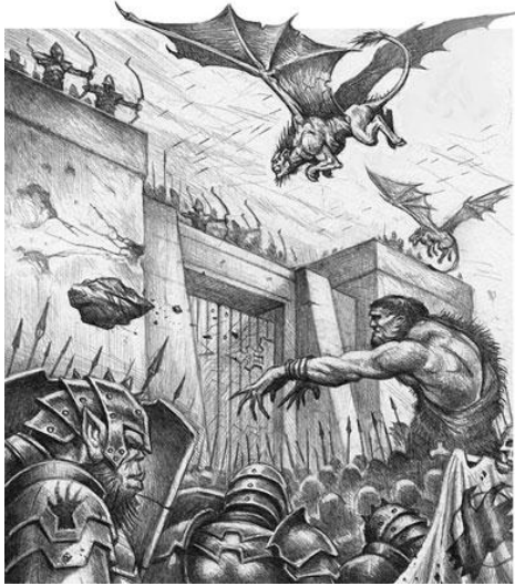
The siege of Loudwater led to great loss of life.

The walled city was the first real obstacle the army had faced. They laid siege to the town and wore down its defences relentlessly. Large amounts of the population of Loudwater fell defending the walls, and countless more died of starvation and plague from the crowded conditions. It seemed that the folk of Loudwater, and by extension, the Vale, were without hope.