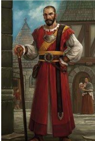
Lord Arron Rein, Leader of the Loudwater Council

High Lord Aaron Rein (male human noble) High Lord Aaron is a widowed man, 50 years old. His wife fell down stairs in the keep years ago and broke her neck. He has two sons and a daughter, all full grown and married now.